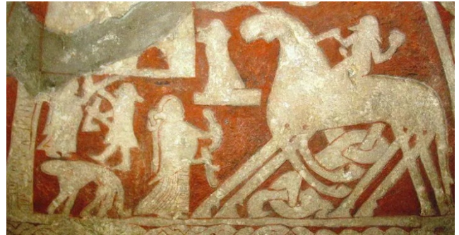
Odin and Sleipnir depicted on the Tjängvide Stone ( https://www.tor.com )

http://www.omniglot.com/writing/runic.htm